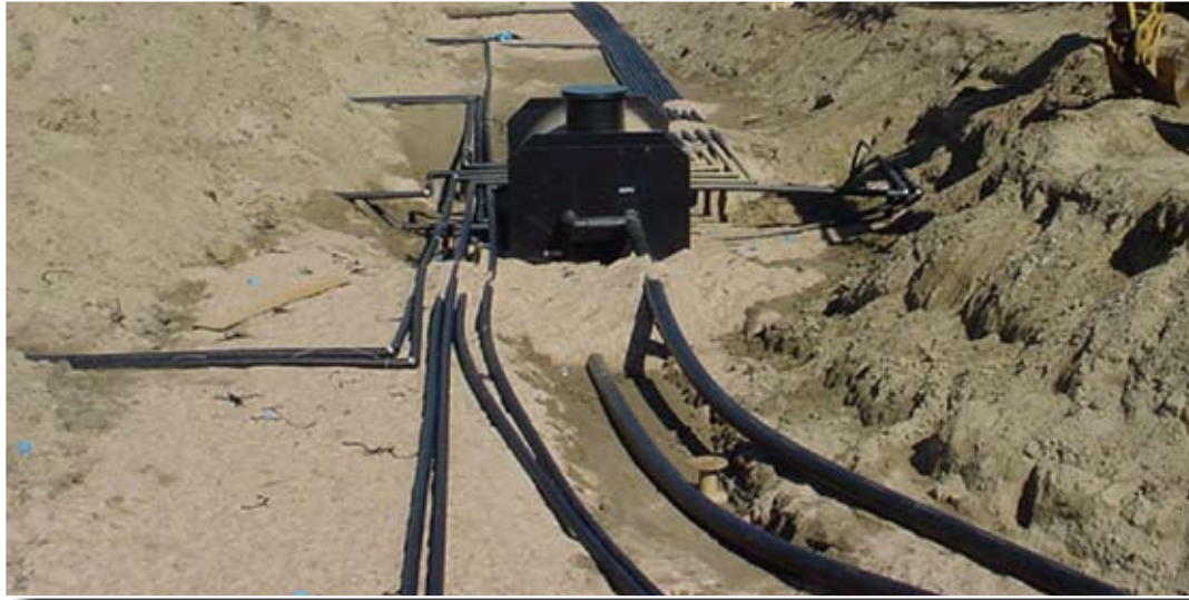
Geothermal well field with ISCO Circuit Maker Vault®