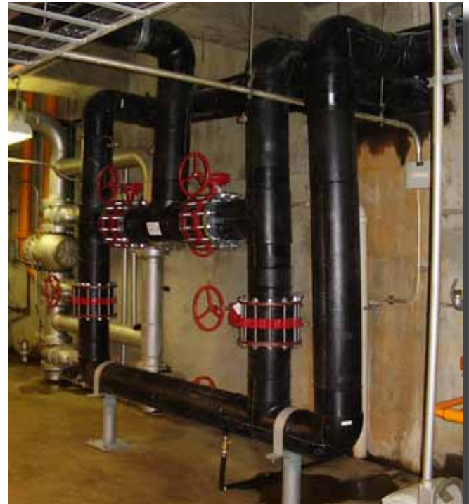
Valve station. This shows the pipe going into the "circle" cooling room as seen in the plan on the first page.

All three spool units came online without any issues or leaks. The project was completed safely and ahead of schedule. Now, the power plant has a new, fully functioning HDPE pipe cooling system that will not rust or corrode.