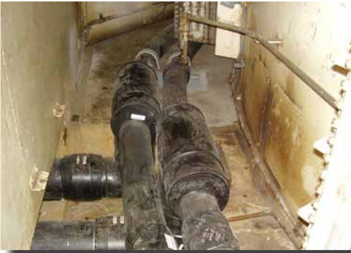
An example of the bending radius used in the supply and return lines: 10-inches down to six-inches.

ity of the product. The three spool units were made of PE3408 three-inch, four-inch, six-inch and 10-inch pipe. All three were identical. ISCO also supplied butterfly valves and transition fittings and assisted with the project installation.