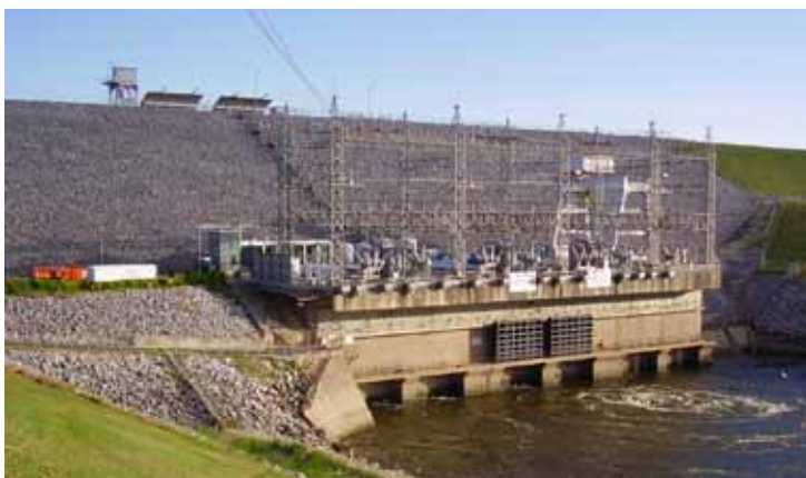
Prospect outside of the dam. There are two gates open in this photo on top of the dam. The third closed one was being worked on at the time.

Jimmy Bauch, regional sales manager for ISCO Industries, worked with the power company to supply the HDPE pipe spools and other materials. ISCO Industries prefabricated all the spool units at its Houston, Texas facility. This was done to speed up installation by eliminating onsite welding, to reduce potential costs associated with onsite fabrication and to minimize safety hazards on location. Prefabricating the spools in a controlled environment, rather than in field conditions, also ensured the qual-