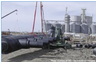
ISCO custom fabricates HDPE structures at their fabrication plants or on the jobsite, as shown above with this 42" fabricated header for chilled water application at an ethanol power plant.