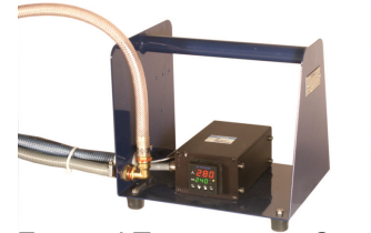
External Temperature Controls