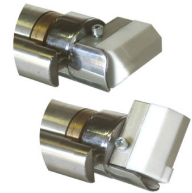
TWISTY rotating welding head assembly